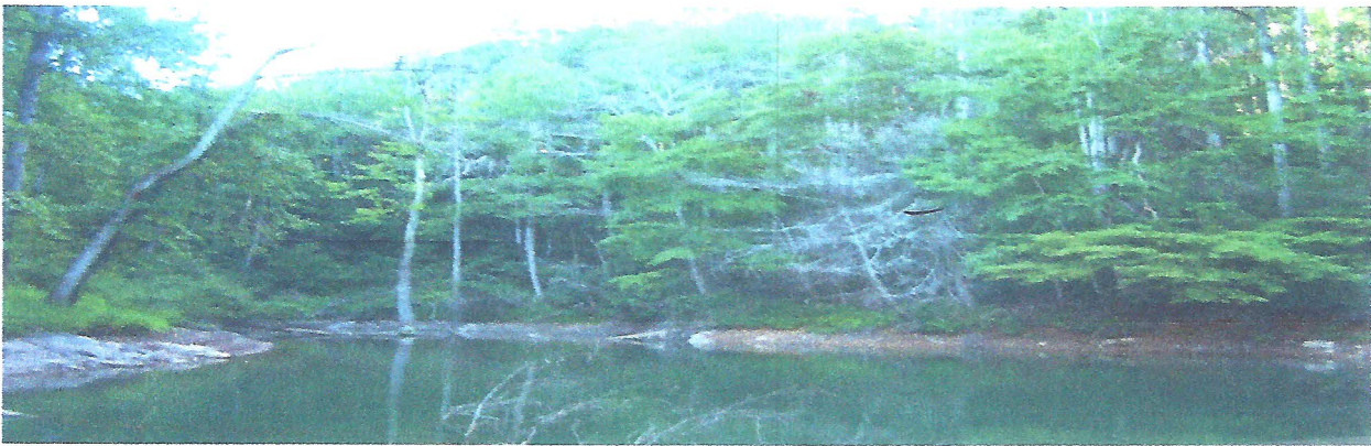
Land Touches In Cove

TL950/MLS#366784: Approx. 23.7 Acres with Watauga Lake frontage. Mostly wooded and bordered by National Forest! Roughed in driveway along the edge of property leading to lake. Older Barn. Very private and set back in a cove. Public water at road. $275,000.00.